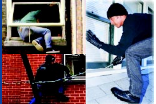
Bajaj Allianz General Insurance Co. Ltd.