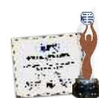
The BIZZ World Business Leader Award, 2010