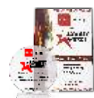
The Customer and Brand Loyalty Award, 2011